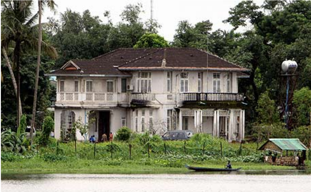
54 University Avenue, Rangoon, Burma, the heavily guarded home of Aung San Suu Kyi where she is at this moment under house arrest.

The Voice of Hope carries this renowned woman's illuminated vision, in which politics and spirituality are inseparable, past the confines of one of the most oppressed and closed nations on Earth, into the world community, with a power to transform the very way we perceive life and liberty. By providing rare insight into Aung San Suu Kyi's philosophical and spiritual beliefs, this thought-provoking and inspiring audio book will inspire listeners with its conciliatory message for all of humanity from the world's most honored political prisoner and her impassioned call for action. Aung San Suu Kyi, as the living embodiment of the power of forgiveness and reconciliation, maintains that true dialogue is the most effective means of engaging dictatorship. That is, if enough of us become voices of hope ourselves.